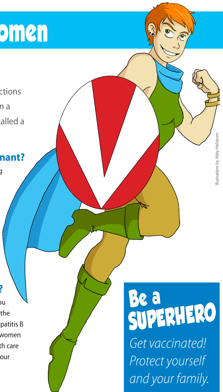
Illustrations by Abby Hellstrom